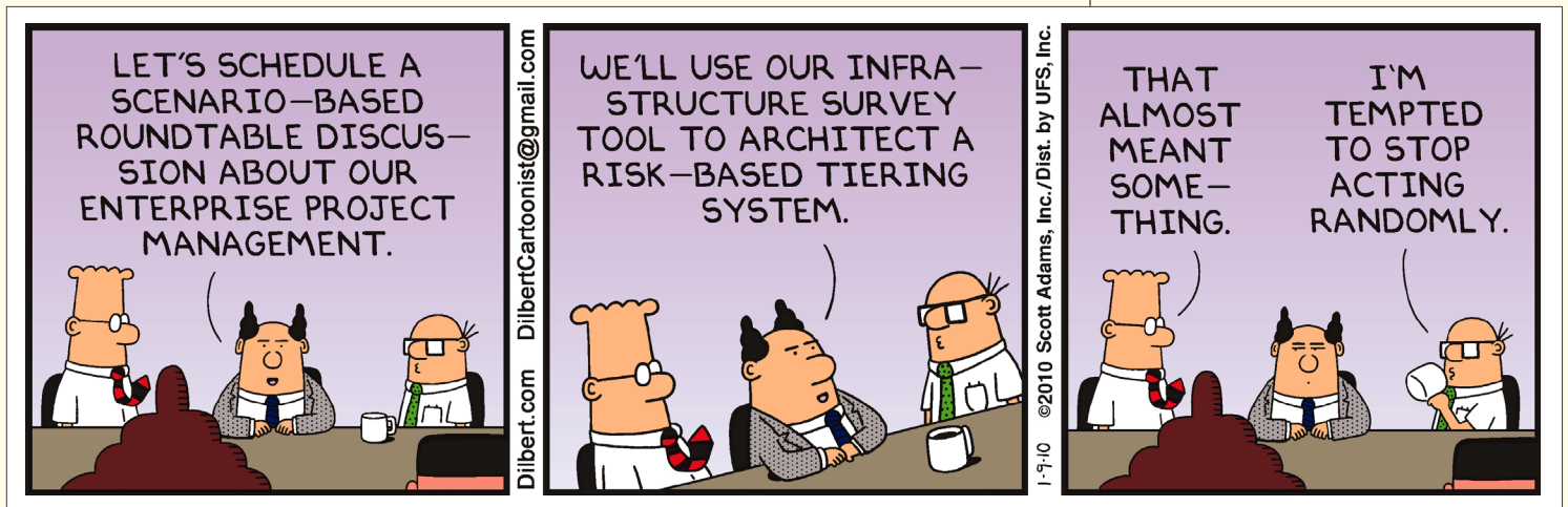
DILBERT

Let us know how you want your newsletter sent at http://www.questsys.com/SANpreference.aspx Choose an emailed PDF or hard copy via USPS.