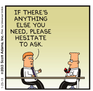
DILBERT: © Scott Adams. Used by permission of Universal Uclick. All rights reserved.